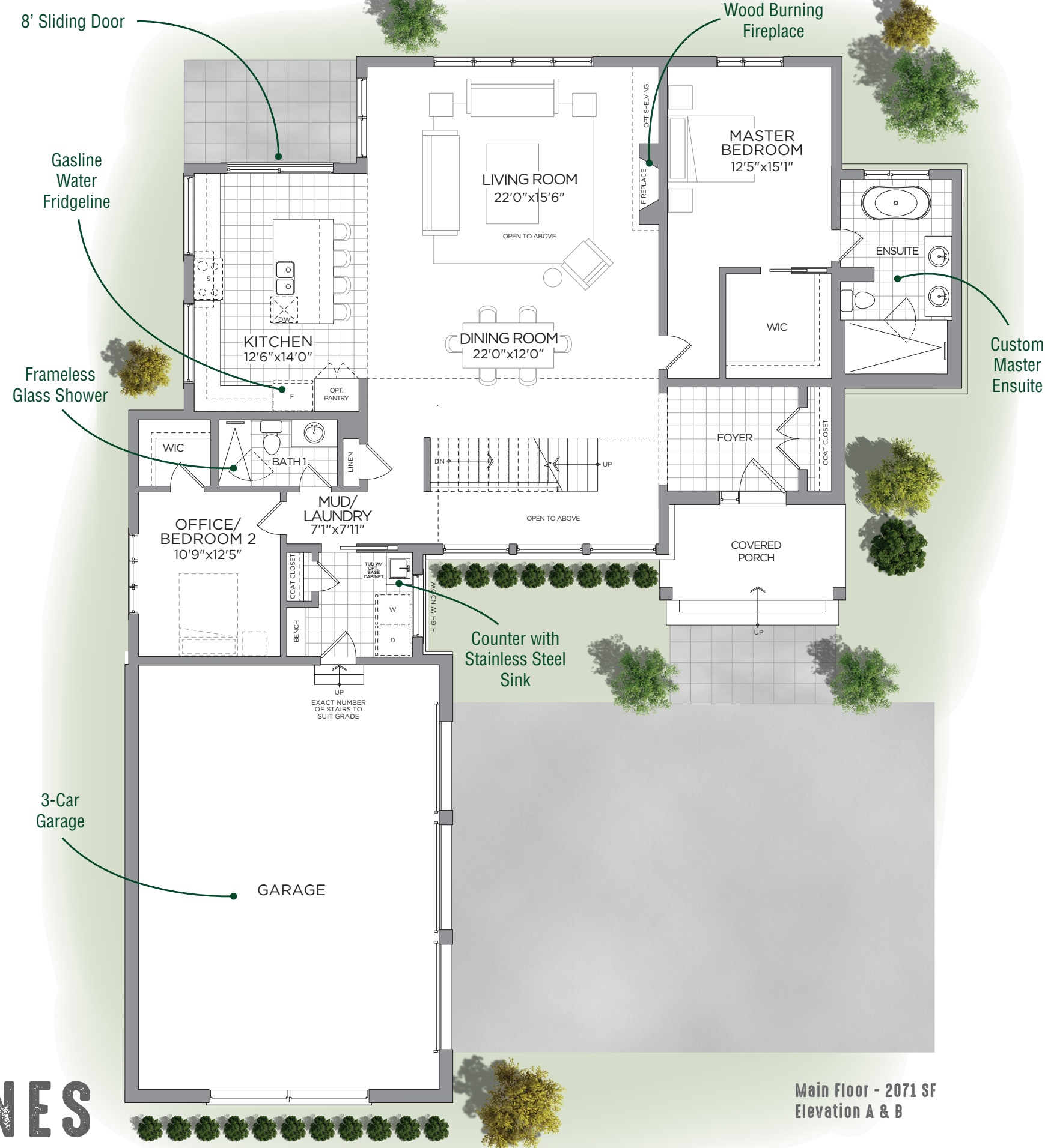
Main Floor - 2071 SF Elevation A & B